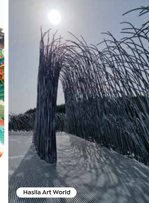
Haslla Art World