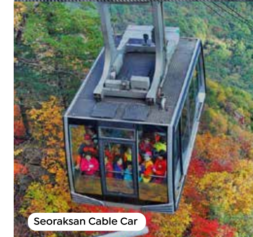
Seoraksan Cable Car