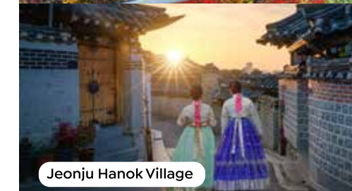
Jeonju Hanok Village