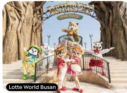
Lotte World Busan