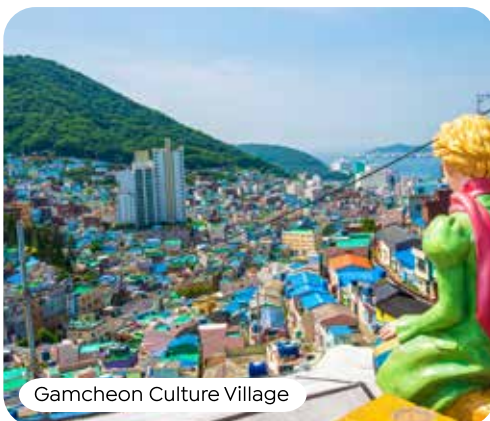
Gamcheon Culture Village