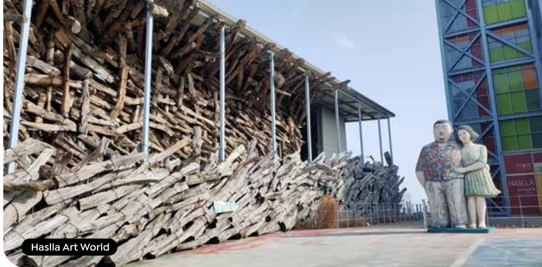
Haslla Art World