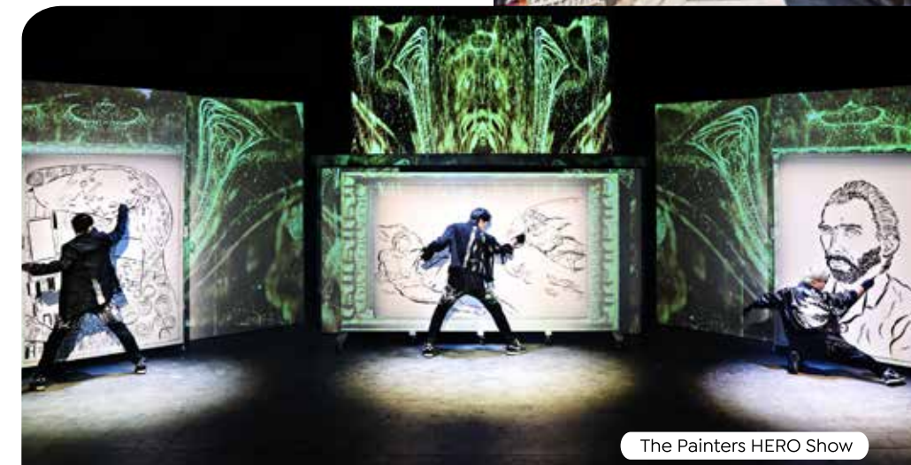
The Painters HERO Show