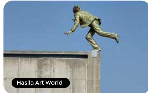
Haslla Art World