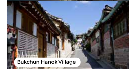
Bukchun Hanok Village