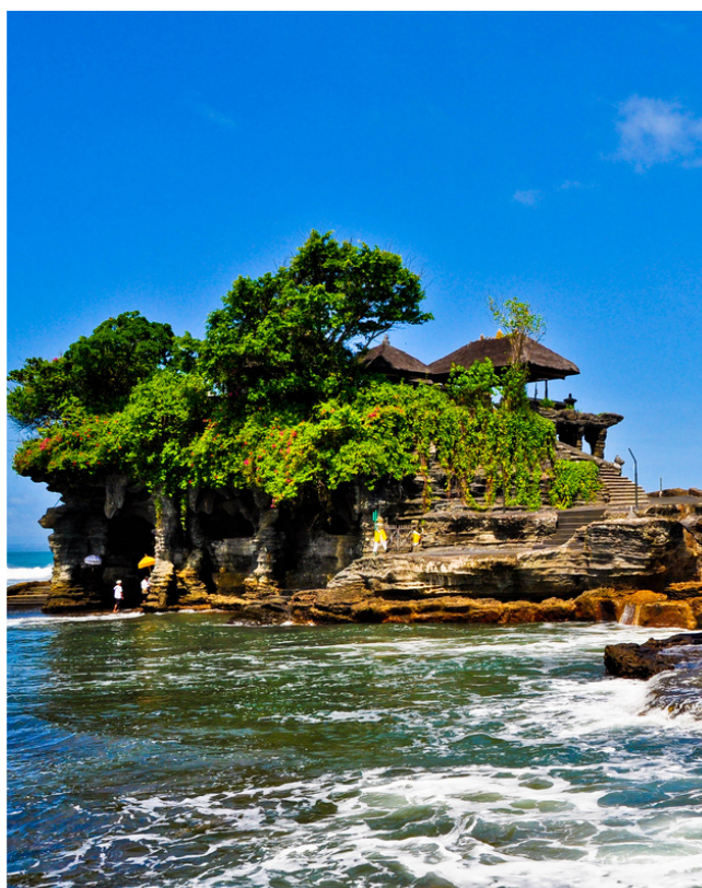
📍 Tanah Lot Temple