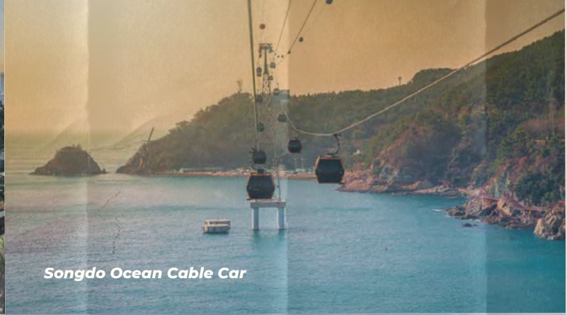
Songdo Ocean Cable Car