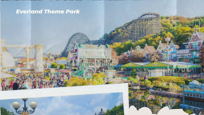
Everland Theme Park