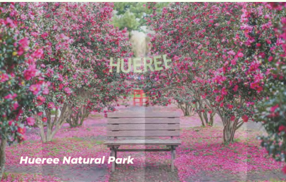
Hueree Natural Park