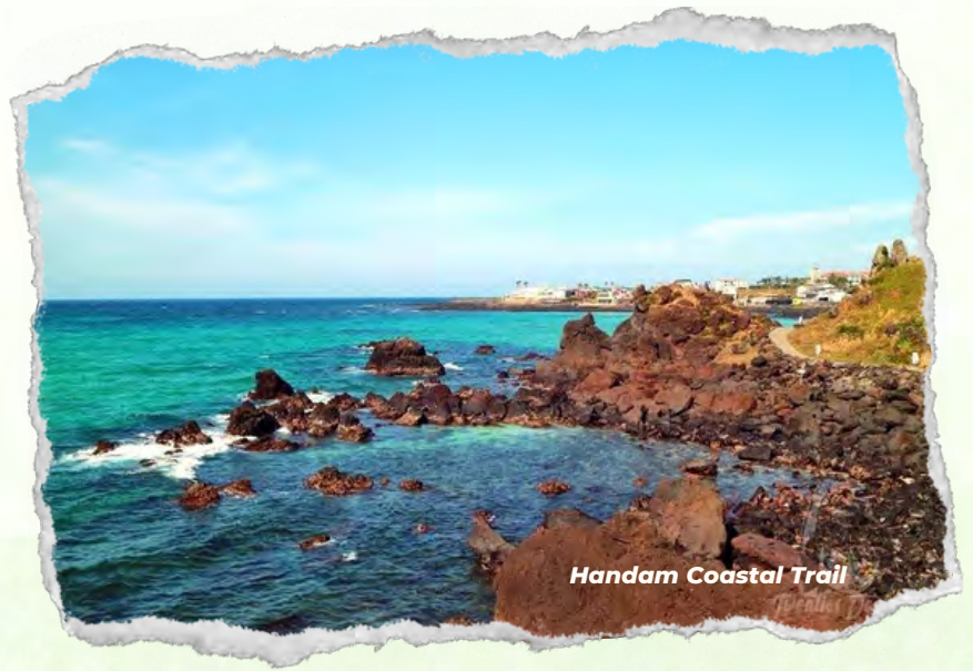
Handam Coastal Trail