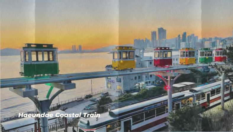
Haeundae Coastal Train