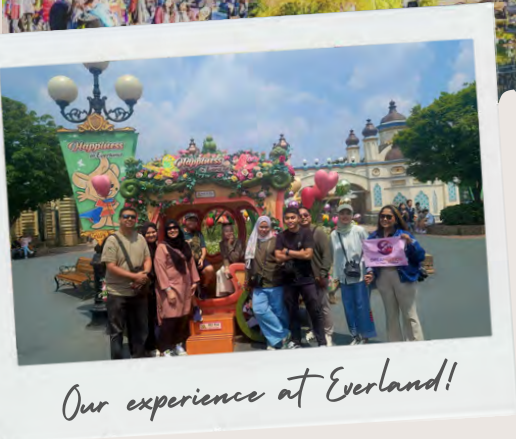
Our experience at Everland!