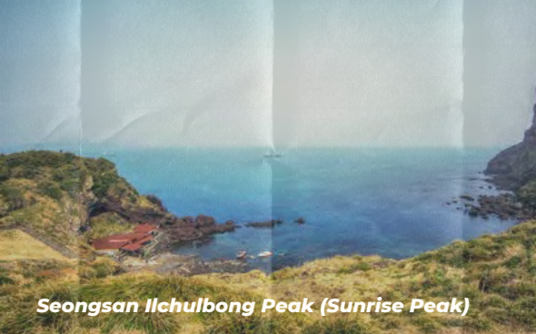
Seongsan Ilchulbong Peak (Sunrise Peak)