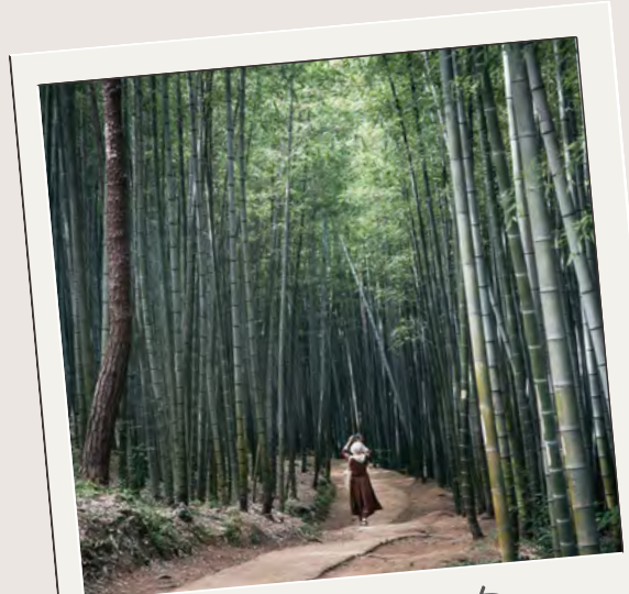
Ahopsan Mountain Bamboo Park