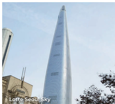
Lotte Seoul Sky