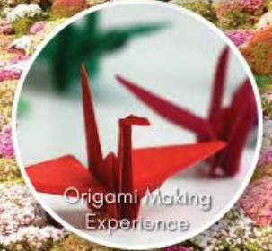
Origami Making Experience