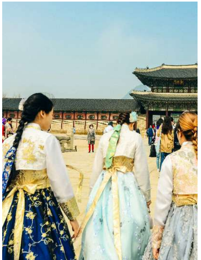
📍 Gyeongbokgung + Hanbok wearing