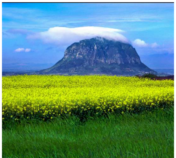
📍 Seongsan Sunrise Peak