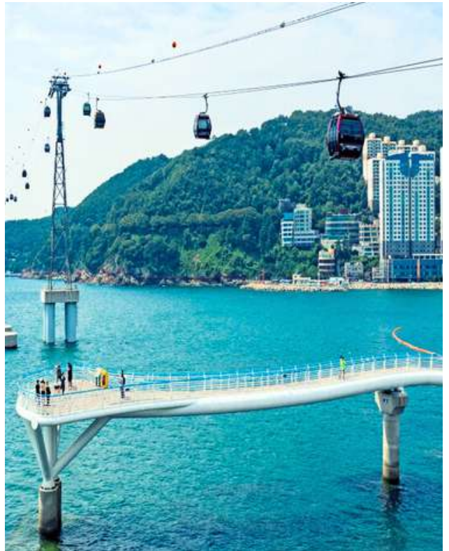
📍 Songdo Cable Car + Songdo Sky Walk

Tour leader (if any) SGD $40 per person including children.