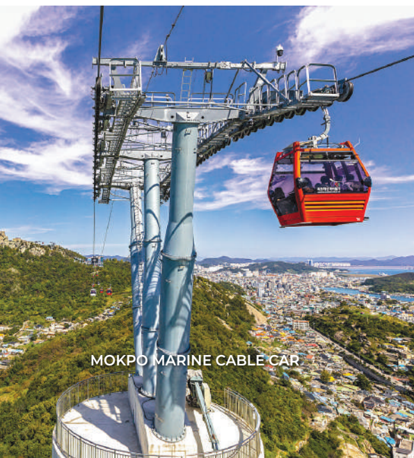
MOKPO MARINE CABLE CAR