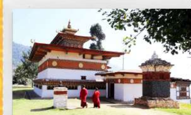
Chimi Lhakhang 寺庙切米拉康