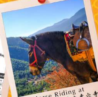
Horse Riding at Tiger Nest 骑马上虎穴寺