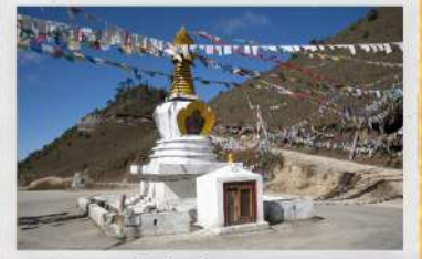
Pele La pass (佩勒拉山口)