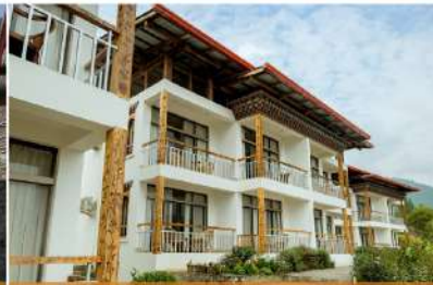
@Zhingkhram Resort, Punakha