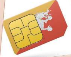
Local Data Sim Card 3GB 网络电话卡