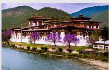
Punakha Dzong 普那卡宗