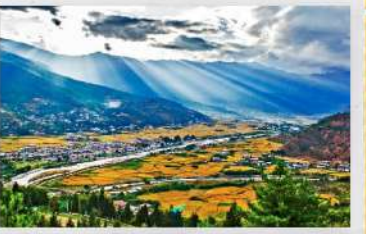
Paro Valley 帕罗山谷