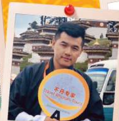
English, Chinese Speaking Guide 中英导游讲解