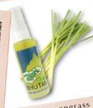
Organic Lemongrass Spray 天然香茅精油