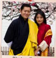
Bhutan Costume Experience 体验传统服装