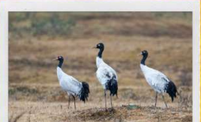
Black-Necked Crane Visitor Centre 黑颈鹤保护中心