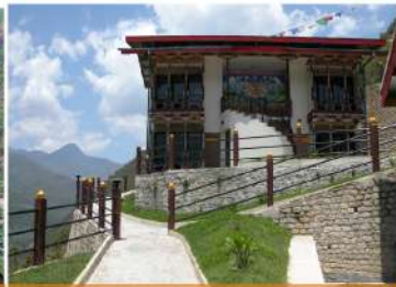
@Yangkhil Resort, Trongsa