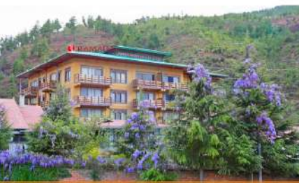
@Hotel Ramada, Thimphu