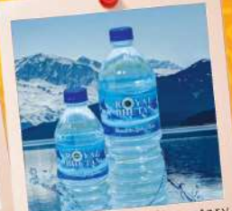
Unlimited Complimentary Water 无限量矿泉水