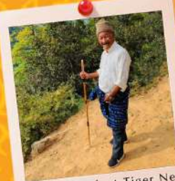
Hiking Stick at Tiger Nest 虎穴寺的登山杖