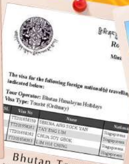
Bhutan Tourist Visa 不丹旅行签证