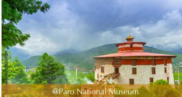
@Paro National Museum