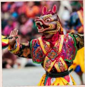
Bhutanese Cultural Dance 文化舞蹈表演