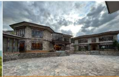
@Tenzinling Resort, Paro