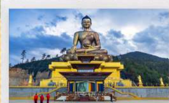
Buddha Dordenma 金剛座釋迦摩尼大佛