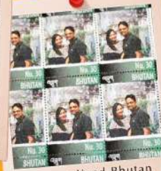
Personalized Bhutan Stamp 印制个人邮票