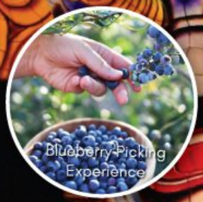
Blueberry Picking Experience