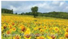
Hokuryu Sunflower Village

Art Hotel Asahikawa or similar / Western room