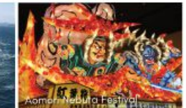
Aomori Nebuta Festival