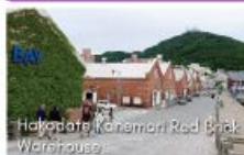
Hakodate Kanemori Red Brick Warehouse

Hakodate Kokusai Hotel or similar / Western room