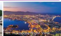
Mt Hakodate Night View