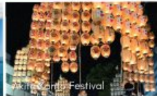
Akita Kanto Festival