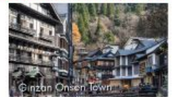
Ginzan Onsen Town

JL178 GAJ-HND 1915-2020 JL035 HND-SIN 0005-0615