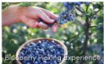
Blueberry Picking Experience

The Lake View Toya Nonakaze Resort or similar / Western room