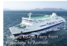
Tsugaru Kaikyō Ferry from Hakodate to Aomori

Shizukuishi Prince Hotel or similar / Western room