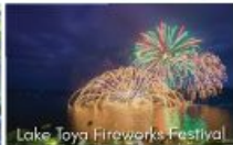
Lake Toya Fireworks Festival