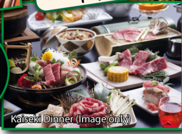
Kaiseki Dinner (Image only)

EARLY BIRD DISCOUNT First 10 customers S$150 off per person