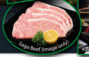
Saga Beef (Image only)