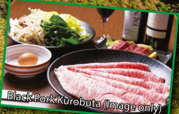
Black Pork Kurobuta (Image only)