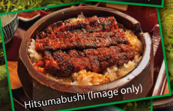
Hitsumabushi (Image only)