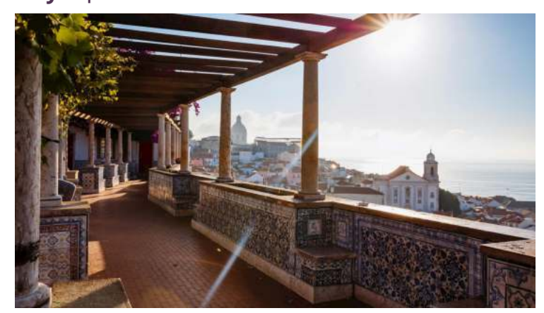
Day 2 | Discover Colourful Lisbon

Delve into Lisbon's centuries-old seafaring heritage today, paying tribute to the brave men who set off from these shores to discover the 'New World'. With our Local Specialist, see the shimmering white Monument to the Discoveries, the iconic suspension bridge spanning the Tagus, and Belém Tower, built as a fortress protecting the city of Lisbon. Dive Into Culture on a sightseeing tour of the UNESCO-listed Hieronymite Monastery, an exquisite testament to 16<sup>th</sup>-century Manueline architecture and art. There's time to join an Optional Experience to the historic towns of Cascais and Sintra. In the evening, perhaps enjoy a traditional Portuguese dinner amidst the heart-wrenching, haunting sounds of the fado.