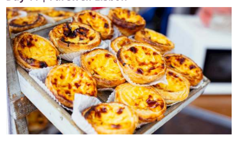
Day 11 | Farewell Lisbon

Say a fond adeus to your fellow travellers at the end of an unforgettable Portuguese holiday. Find out more about your free airport transfer at trafalgar.com/freetransfers.