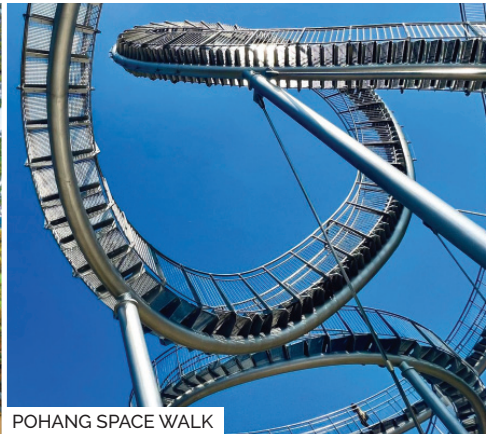
POHANG SPACE WALK