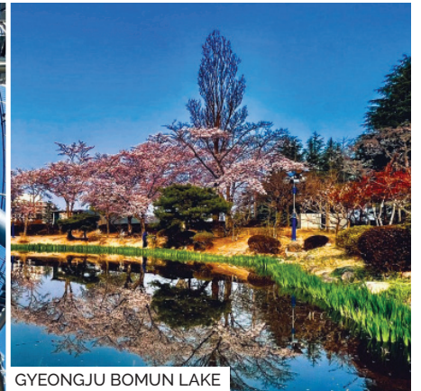
GYEONGJU BOMUN LAKE

an artistic atmosphere to the village. Built along the hillside, there are small stepped houses with lovely crayon colors. There are also maze-like alleys, making this a fairy tale world. You can relive your childhood in Taejongdae by riding the Danubi train . A natural park of Busan with magnificent cliffs facing the open sea on the southernmost tip of the island of Yeongdo-gu. Thereafter, proceed to Yongdusan Park which offers a beautiful view of Busan Port and the surrounding scenery. Next, visit Nampo-dong International Market and BIFF Square , which promote the advancement of Korea's film industry, and also contribute to Busan's newly transformed district as an international cultural tourist city. The biggest charm of Nampo-dong is that it has a variety of fashionable shopping products, allowing you to shop to the fullest and enjoy the pleasure and fun of shopping.