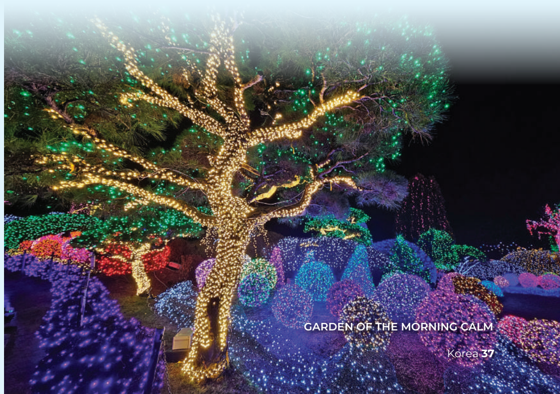
GARDEN OF THE MORNING CALM