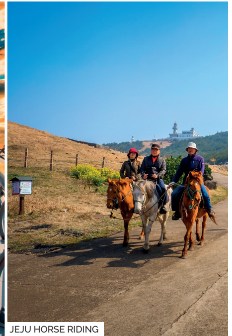
JEJU HORSE RIDING

Note: Songdo Skywalk no admission in case of rain.