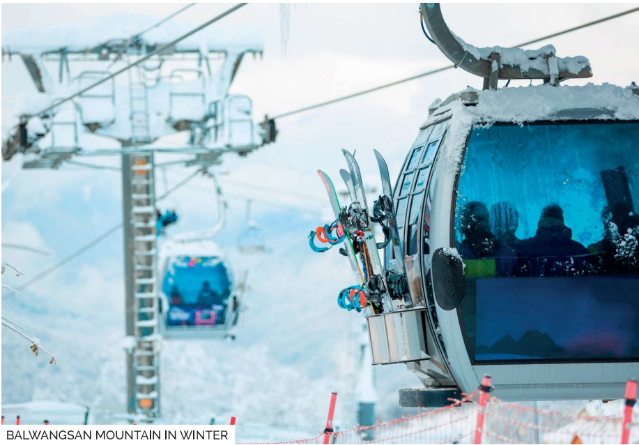
BALWANGSAN MOUNTAIN IN WINTER