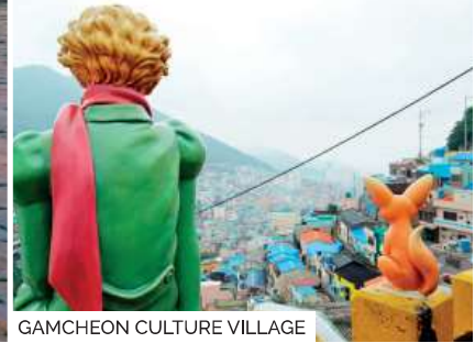
GAMCHEON CULTURE VILLAGE

adventure with Lotty and Lorry. Hop onto thrilling rides and Have fun during the amazing parades.