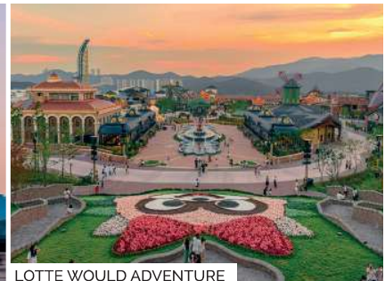
LOTTE WORLD ADVENTURE