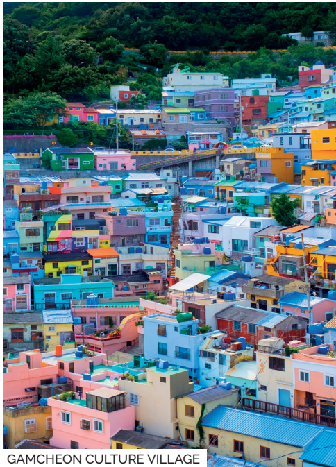
GAMCHEON CULTURE VILLAGE