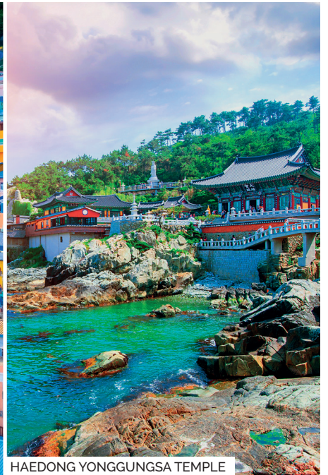
HAEDONG YONGGUNGSA TEMPLE

welcome the sunrise. It is a not-to-be-missed photo-taking spot! Thereafter, visit Whale Cultural Village to see the good old days of whaling through sculptures and murals.