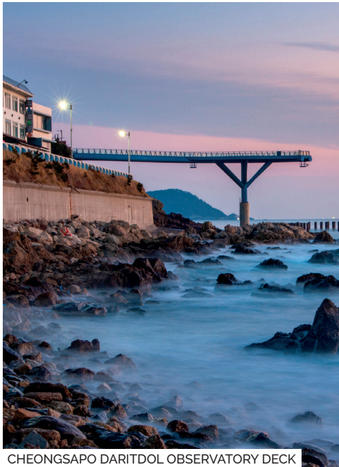
CHEONGSAPO DARITDOL OBSERVATORY DECK