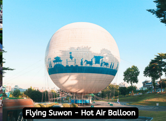
Flying Suwon - Hot Air Balloon