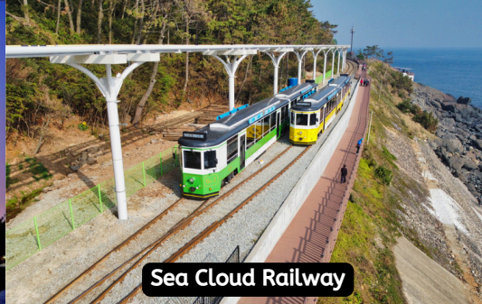
Sea Cloud Railway