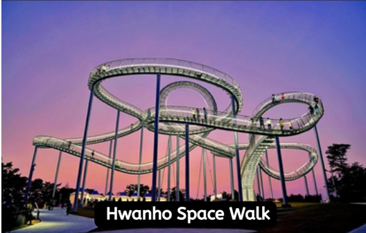
Hwanho Space Walk