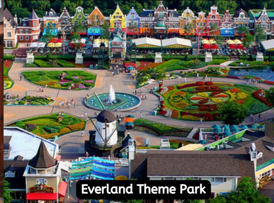
Everland Theme Park