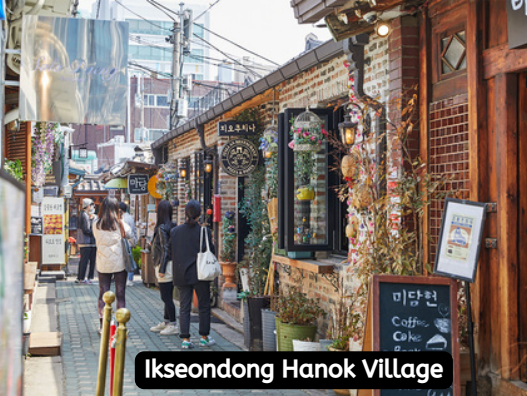
Ikseondong Hanok Village