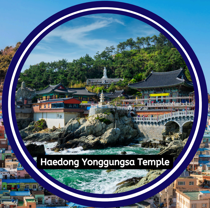
Haedong Yonggungsa Temple