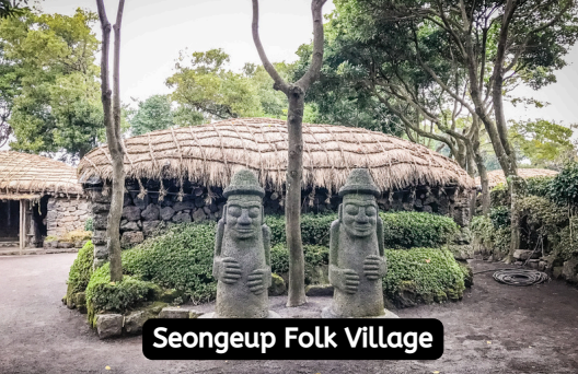
Seongeup Folk Village