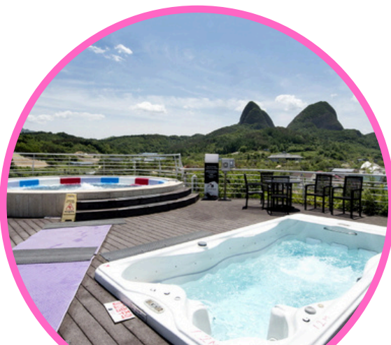
Jinan Red Ginseng Spa

※In case of closure of the Jinan Red Ginseng Spa, it will be changed to a hot spring water world.