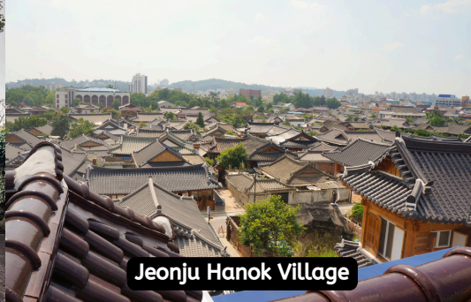
Jeonju Hanok Village