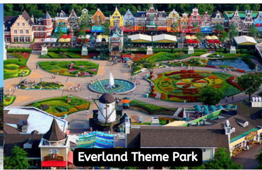
Everland Theme Park