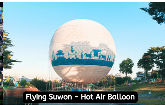
Flying Suwon - Hot Air Balloon