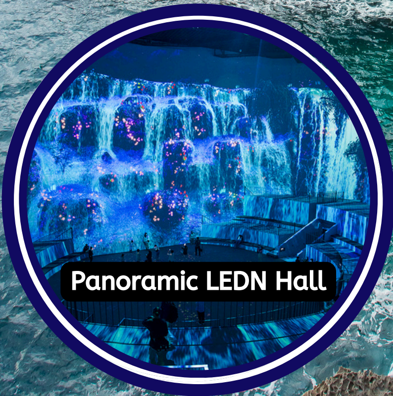
Panoramic LEDN Hall