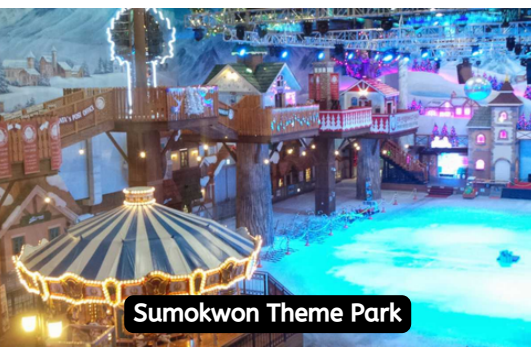
Sumokwon Theme Park