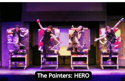
The Painters: HERO