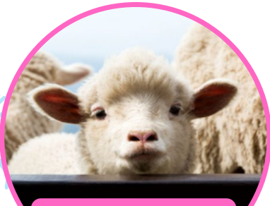
Daegwallyeong Sheep Farm