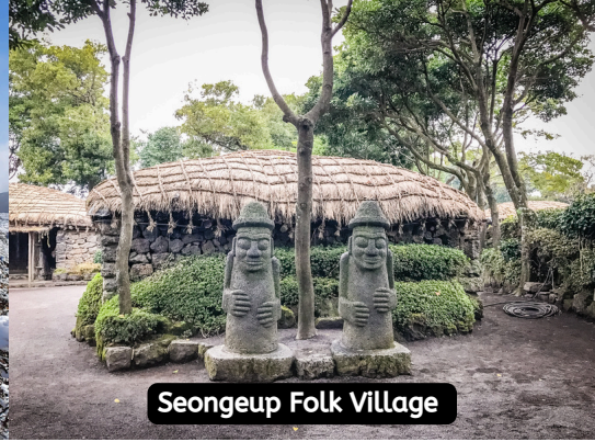
Seongeup Folk Village