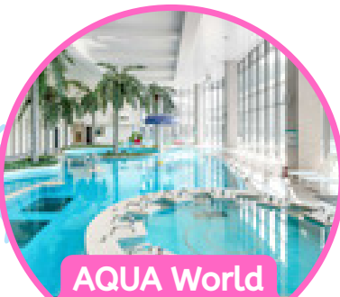
AQUA World (Hot Spring)

* If no Ice Fish Season will change attractions to Daegwallyeong (Sheep Ranch + DIY Ice-Cream)