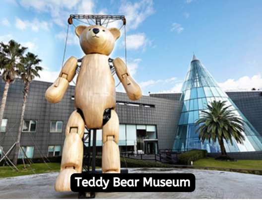
Teddy Bear Museum