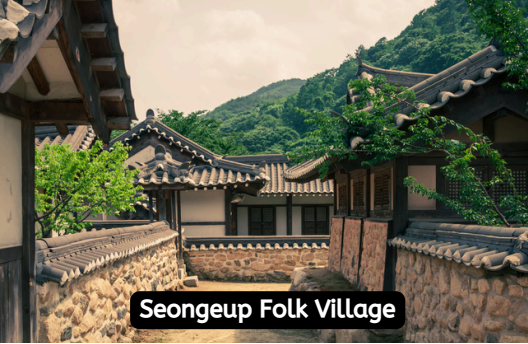
Seongeup Folk Village