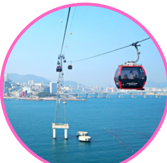
Songdo Cable Car