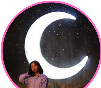
Illusion Art Museum