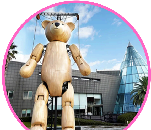
Teddy Bear Museum