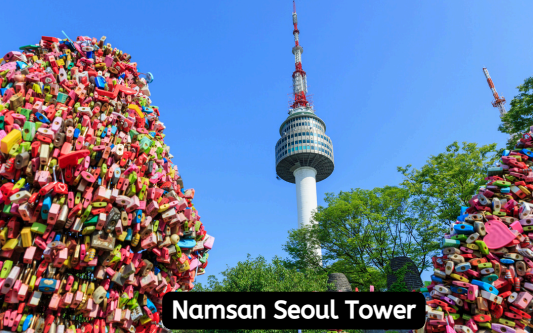
Namsan Seoul Tower