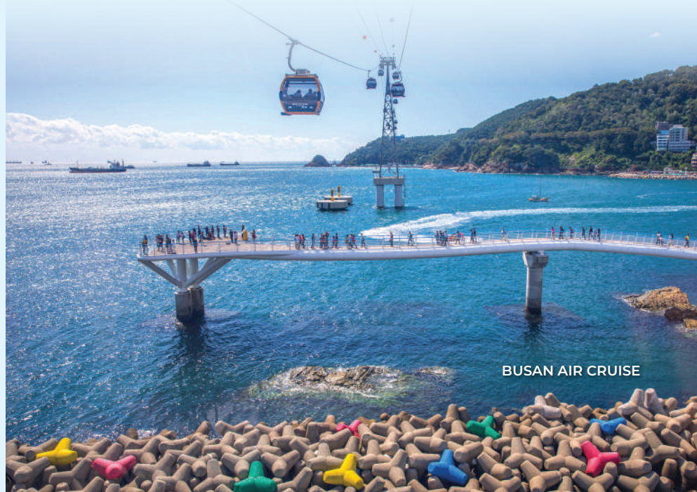
BUSAN AIR CRUISE

*Note: Hotels subject to final confirmation. Should there be changes, customers will be offered similar accommodations as stated in this list.