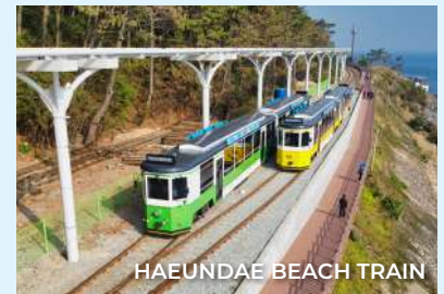
HAEUNDAE BEACH TRAIN

After breakfast, drop by Healthy Liver showroom for a look at its renowned healthy products before transferring to Incheon International Airport for your flight back to Singapore.