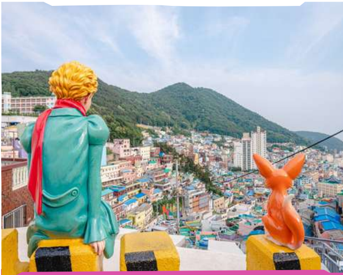
📍 Gamcheon Culture Village