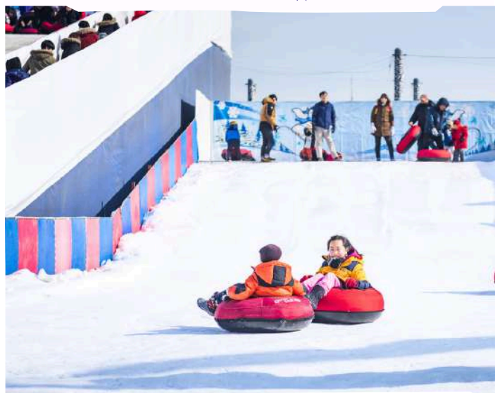
📍 Snow ski activities