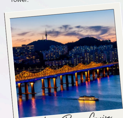
Han River Cruise