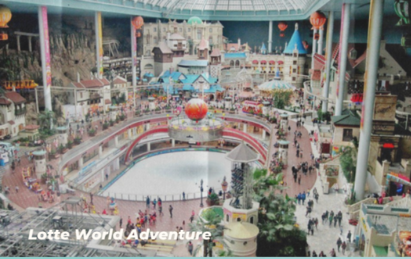
Lotte World Adventure