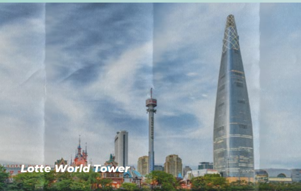
Lotte World Tower