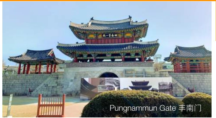
Pungnammun Gate 丰南门