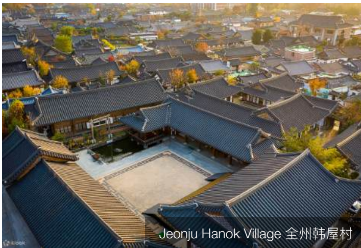
Jeonju Hanok Village 全州韩屋村