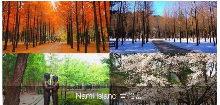
Nami Island 南怡岛