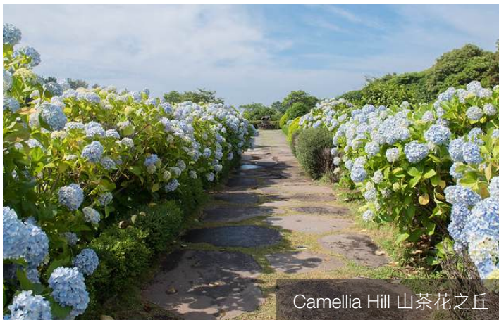
Camellia Hill 山茶花之丘